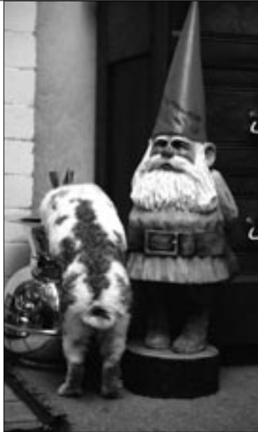
Bailey checks out the holiday decorations

As those of us who have rabbits know, rabbits have an insatiable sweet tooth. However, the cookies and candies we tend to have in our homes at the holidays aren't good for rabbits. Chocolate can be a toxin to rabbits, and foil or plastic candy wrappers can cause intestinal blockages. Be sure to keep these items up high enough that bunny can't reach them. Even holiday treats that aren't poisonous to rabbits, such as dried cranberries, should be given to rabbits in moderation. Just like people, bunnies can gain weight over the holiday if we let them over-indulge.