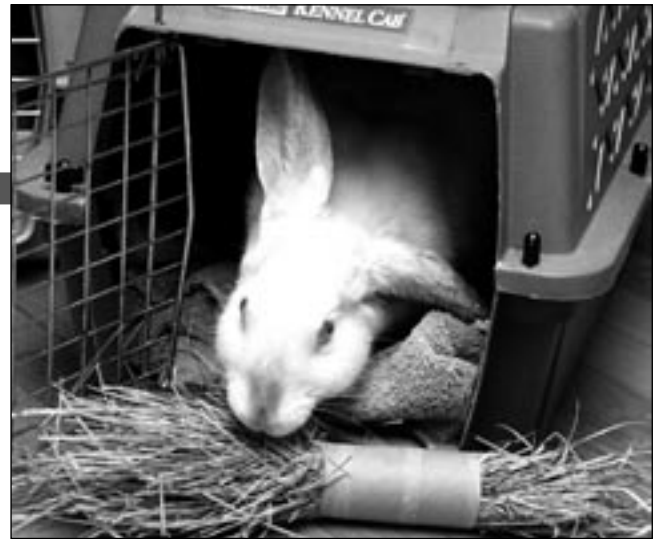
Have extra hay, pellets and bottled water on hand.

Once you have your emergency kit assembled and your evacuation plan arranged your work is only half done. The other half of emergency preparedness is to practice your plan and make sure your plan and