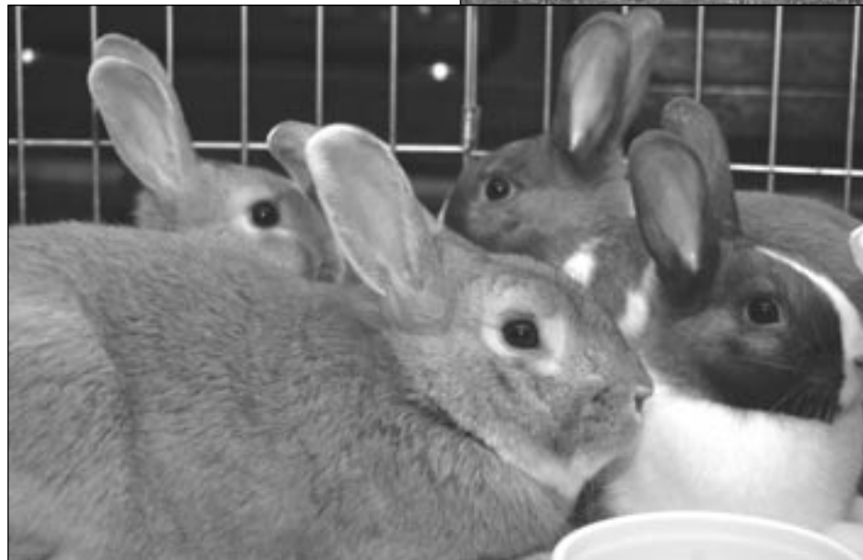
Happy to be together again.