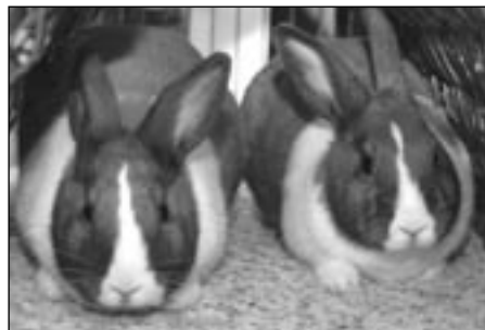
Franklin & Piper

"Wine and Wags" adoption event at Garden World, located at 10506 Broadacres Rd NE in Hubbard. Hours are 11am–4pm.