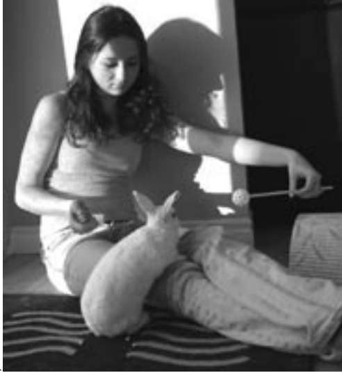
Little Angel following a target. Note the clicker in the girl's right hand.

Training provides mental and physical stimulation for your rabbit. Best of all, the time spent together deepens the bond between human and rabbit. While it is possible to teach bunny to do tricks, the training is useful in practical ways: cooperating with nail clipping, getting