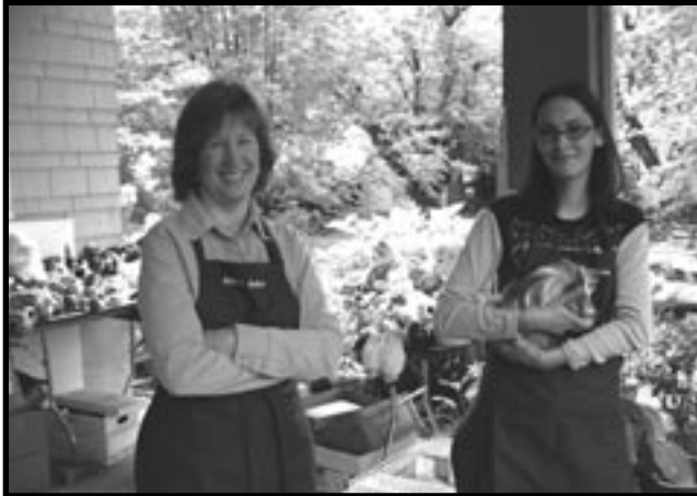
Garage sale volunteers cuddle a guinea pig while they wait for the next customer.

The sale has been our single largest fundraising effort, and all funds raised go toward our programs which directly